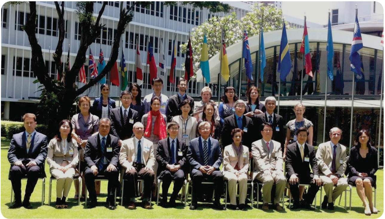
Participants of the Informal Expert Working Group Meeting on Surveillance, Prevention and Management of Viral Hepatitis in the Western Pacific Region Manila, Philippines, 1–2 April 2014