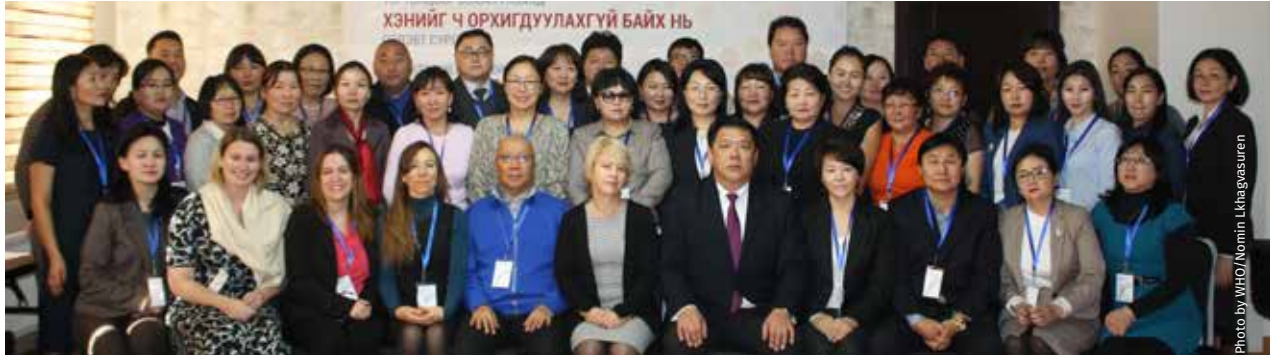
At the second training workshop, conducted for heads and specialists of nine district health centres of the capital Ulaanbaatar and health departments of three Gobi aimags. Ulaanbaatar, November, 2016