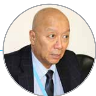
Dr SOE NYUNT U WHO Representative in Mongolia

WHO complements the Government of Mongolia and the Ministry of Health for their commitment and leadership in incorporating the