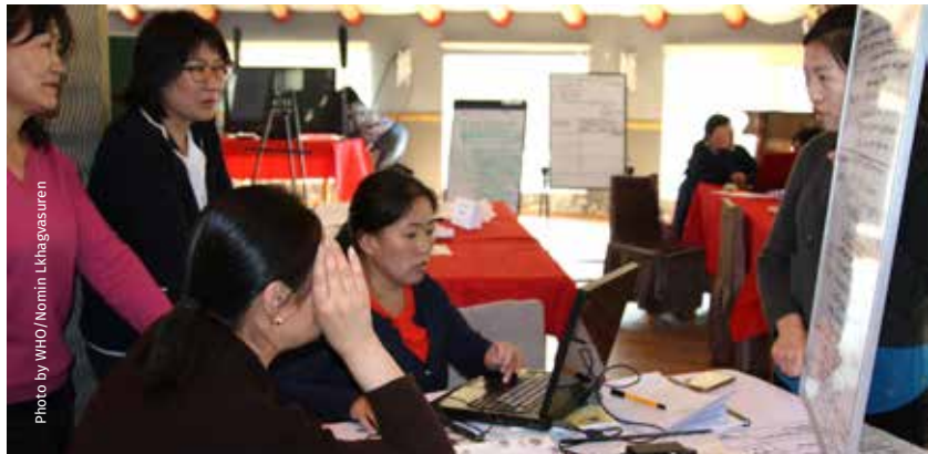
During training, the groups drafted aimag and district health sector strategies and plans of actions. Tsenkher soum, Arkhangai aimag, September 2016

Three Leaving No One Behind workshops, each three days, took place in September and November 2016 and were co-organized by Mongolia's Ministry of Health, the Ulaanbaatar City Department of Health and the Arkhangai aimag Department of Health. Specialists from all three levels of WHO – headquarters, the Regional Office for the Western Pacific and the country office – led the training, which was geared to help local governments and departments of health reflect